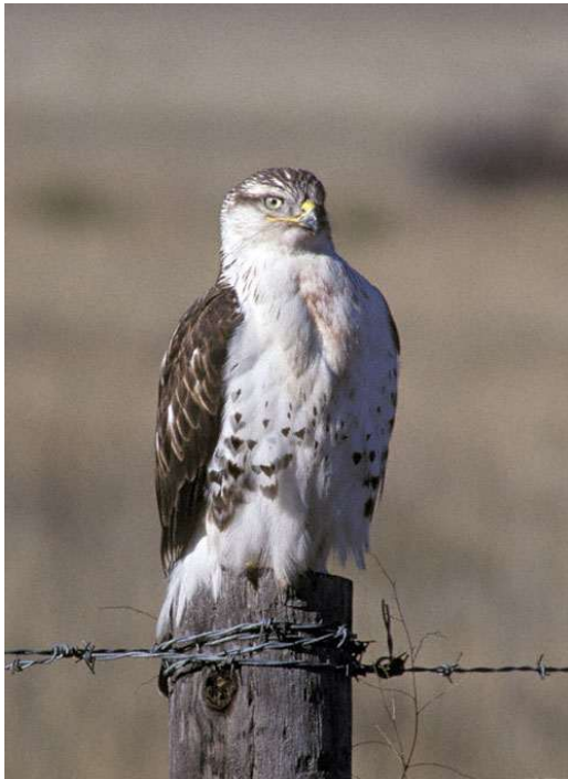
Ferruginous Hawk

Day 3: Sulfur Springs Valley and Whitewater Draw Wildlife Area. Today we travel east toward Sulfur Springs Valley. The valley stretches from north of Willcox south to the Mexican border. The Sulphur Springs Valley Loop provides a 35-mile driving tour. The focal point of the loop is the Willcox Playa – when the playa has sufficient water, it provides habitat for thousands of migratory birds. The agricultural fields, ponds, and desert scrub also offer excellent birding opportunities, especially in the winter months. The entire Valley is a major wintering ground for raptors including Prairie Falcon, Ferruginous Hawk and Golden Eagle. Specialty birds in this location include Bendire’s Thrasher, Pyrrhuloxia, Scaled Quail, Curve-billed Thrasher, and Greater Roadrunner. Within this expansive valley is a wildlife area called Whitewater Draw Wildlife Area, where tens of thousands of Sandhill Cranes gather in this large wetland complex. Snow and Ross’s Geese and other variety of waterfowl can