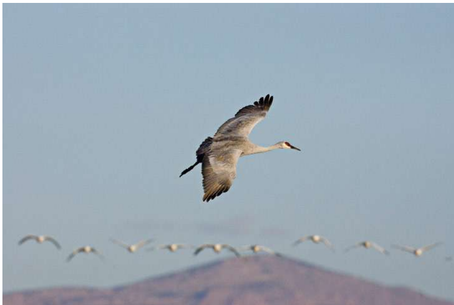
Sandhill Cranes