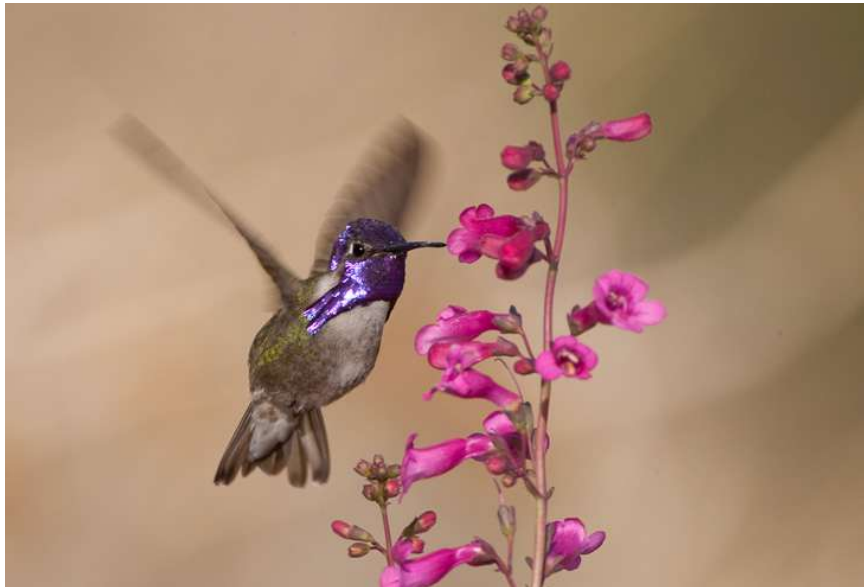
Costa's Hummingbird

We'll start the day early in the grasslands north of Sonoita searching for the elusive Baird's Sparrow in with the flocks of Savannah, Vesper and Grasshopper Sparrows. Several other open country birds can be found here like Chestnut-collared Longspur, White-tailed Kite, Say's Phoebe, Loggerhead Shrike and Chihuahuan Meadowlark.