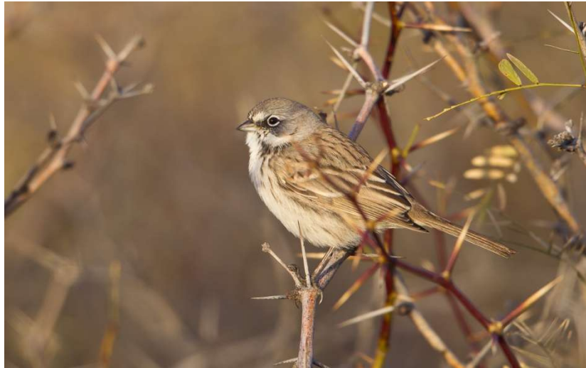
Sagebrush Sparrow

Day 2: Tucson area – Sweetwater Wetlands and Santa Cruz Flats. We'll spend today birding the low country around Tucson looking for Gilded Flicker, Greater Roadrunner and Costa's Hummingbird and at the Sweetwater Wetlands Park for waterfowl and impressive numbers of Yellow-headed Blackbirds. The Sweetwater Wetlands are a series of constructed wetlands with