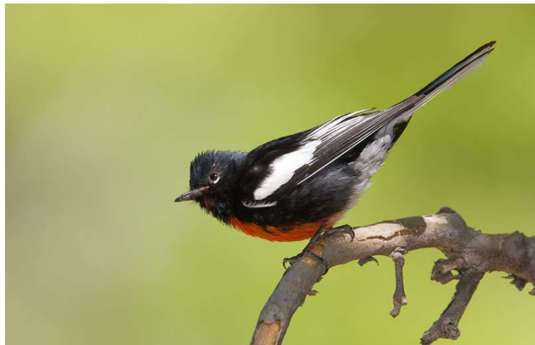
Painted Redstart

The Huachuca Mountains are the third highest of the Sky Island mountain ranges in southeastern Arizona. Today we visit the Nature Conservancy Preserve at Ramsey Canyon, one of the first well-known birding sites in Southeast Arizona. Ramsey Creek descends through oak woodlands, its banks lined with sycamores, maples, cacti, yucca, and agaves. Here we may