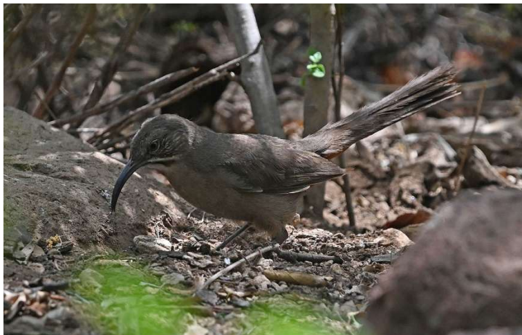
Crissal Thrasher

ponds, cattail marshes, and mudflats surrounded by desert. Species found here include Mexican Duck, Common Gallinule, Vermilion Flycatcher, Black Phoebe, Verdin, and Abert's Towhee. We'll also travel northwest on I-10 toward Phoenix birding along the way to the Santa Cruz Flats to look for some specialty birds that are hard to find elsewhere like Crested Caracara, Prairie Falcon, Sagebrush Sparrow, Mountain Plover, and potentially up to five species of Thrasher – Curve-billed, Crissal, Bendire's, LeConte's, and Sage. In recent years,