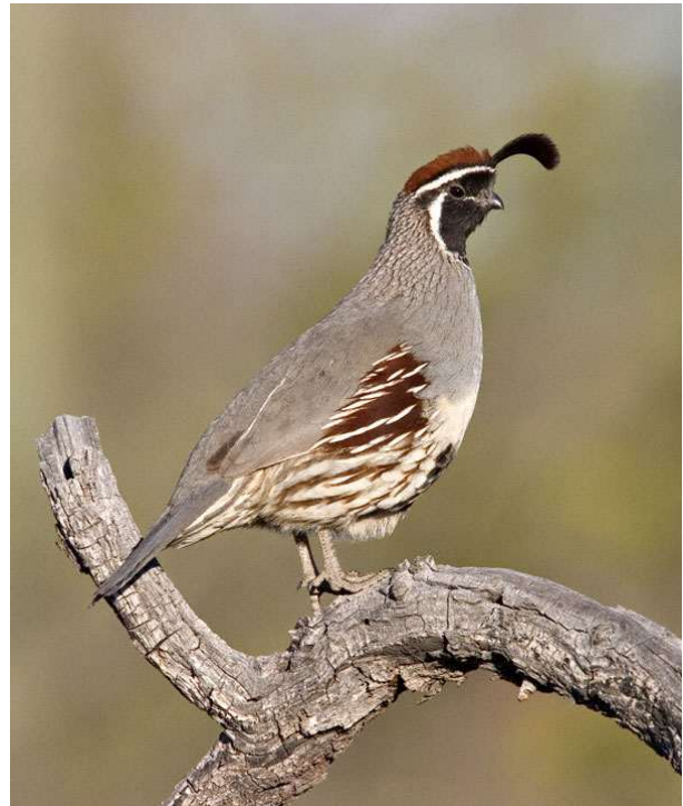
Gambel's Quail

Canyon, at a higher elevation than Tucson, the canyon forms a deep, wooded ravine that attracts birds to the sky islands. Here we will get our first taste of the birds that make birding Southeastern Arizona famous like Mexican Jay, Acorn Woodpecker, Arizona Woodpecker, Bridled Titmouse, White-breasted Nuthatch, Painted Redstart, Rock and Canyon Wrens. The feeders at the Santa Rita Lodge will give us an excellent serving of the diversity of juncos with three different forms of Dark-eyed Junco (Oregon, Gray-headed and Pink-sided) comingling with the Yellow-eyed Junco. In recent winters at least one Elegant Trogon has been seen roaming up and down the canyon. We continue birding in Tubac, Anza Trail along the banks of the Santa Cruz River through a lush cottonwood-willow riparian forest and mesquite bosque. The river is a corridor for migrant birds, here we may find Rufous-backed Robin, Rose-throated Becard, Ash-throated Flycatcher, Lesser Scaup, Bufflehead, Curve-billed Thrasher, and Lawrence's Goldfinch, to name a few. We also explore the nearby Montosa Canyon, the less birded region of the Santa Rita Mountains - common sightings in this location include Canyon Wren, Abert's Towhee, Dusky-capped Flycatcher, Vesper Sparrow, Hutton's Vireo, and Northern Beardless-Tyrannulet. Overnight: Tubac Golf Resort & Spa, Tubac.