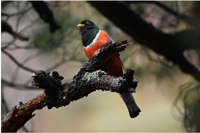
Elegant Trogon © Troy Hibbitts

Day 6: Green Valley, Santa Rita Mountains, and Tubac. Today we will spend the day exploring the beautiful Santa Rita Mountains. We first travel south toward Green Valley to Canoa Ranch Conservation Park. The ponds at the park are magnets for wintering waterfowl, here we can also expect to see Costa's Hummingbird, Rufous-winged Sparrow, Black-throated Gray Warbler, and Gambel's Quail. The centerpiece to the Santa Rita Mountains is Madera