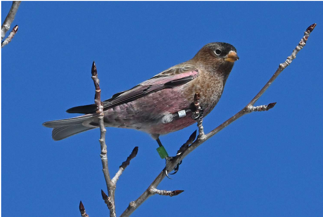
Brown-capped Rosy-Finch

When the chill of winter settles across the Southwest, New Mexico transforms into a haven for birders seeking dramatic skies, quiet desert trails, and the thunderous wingbeats of thousands of migrating birds. From the snow-dusted peaks of the Sandia Mountains to the golden wetlands of Bosque del Apache, winter birding in New Mexico offers a rare blend of spectacle, solitude, and species diversity. Over the course of our trip, we'll move from high-elevation forests to wide-open wetlands and peaceful desert valleys, experiencing the full range of New Mexico's winter birdlife. Expect breathtaking scenery, exceptional species diversity, and the kind of calm, spacious birding that makes winter in the Southwest so special. With expert guiding, comfortable pacing, and a welcoming group atmosphere, this tour is designed to immerse you in the beauty, stillness, and surprise of New Mexico's cold-season birding. But New Mexico's winter birding is not just about the birds— it's a place