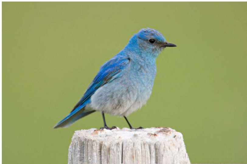
Mountain Bluebird

The Sangre de Cristo Mountains are the southern sub-range of the Rocky Mountains, stretching from Santa Fe north to the Colorado border. We will start off by driving up towards Los Alamos, northwest of Santa Fe. Between the Jemez Mountains, which overlook Los Alamos, and the canyons in and around the city, we will have the opportunity to