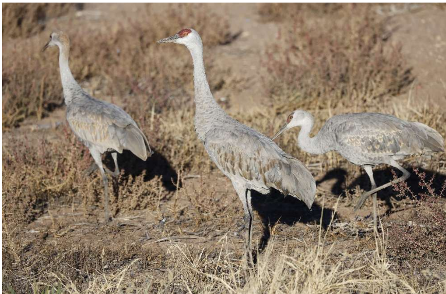
Sandhill Cranes

Brown-capped, and Gray-crowned—at a single feeder station. These high-altitude specialties descend from alpine zones to feed, offering rare photographic and observational opportunities. The surrounding coniferous forests also host Mountain Chickadees, Red-breasted Nuthatches, and Townsend's Solitaires, while lower elevations may yield Western Bluebirds and Red Crossbills. Overnight: Home2 Suites Albuquerque Airport.