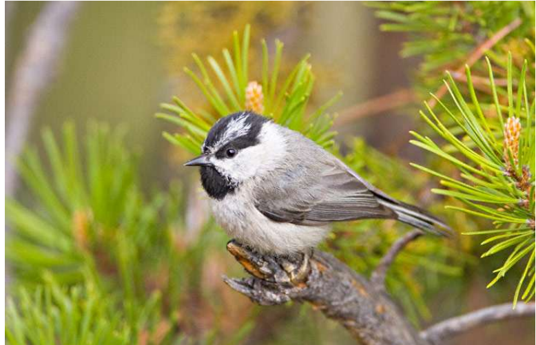
Mountain Chickadee

Today we bird lower lying locations around Albuquerque looking for Pinyon Jay, Sagebrush Sparrow, and Juniper Titmouse before we climb up into the Sandia Mountains, ascending all the way to Sandia Crest. For those willing to brave the cold, Sandia Crest offers one of the most unique winter birding experiences in North America: the chance to see all three Rosy-Finch species—Black,