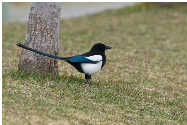
Black-billed Magpie

Overnight: Holiday Inn Express, Gunnison.