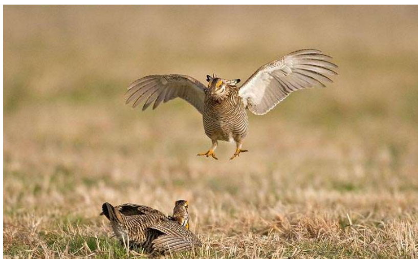
Greater Prairie-Chickens

Day 9: Wray to Scott City, Kansas. Wray is one of the best places in the state to see Greater Prairie-Chickens. Wray sits in the heart of Colorado's eastern plains, surrounded by sandsage prairie and mixed-grass habitat – the preferred breeding grounds of the Greater Prairie-Chicken. We will most likely hear the Greater Prairie-Chickens