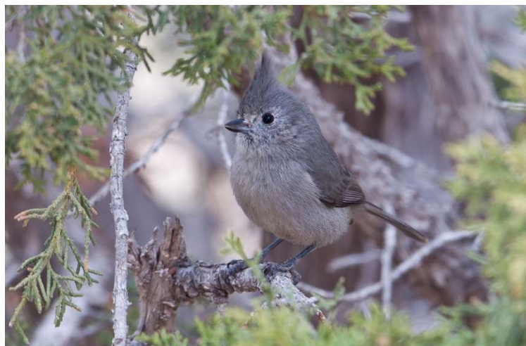
Juniper Titmouse

several locations along the way. We will stop at Walden Reservoir State Wildlife Area, where there is a possibility of seeing fifteen species of ducks. We'll also search for other species in the foothills, including Sandhill Cranes, Green-tailed and Spotted Towhees, Vesper Sparrows, and various raptors. Cameron Pass will provide a final opportunity to observe any remaining boreal forest bird species, including Pine Grosbeak, Cassin's Finch, Canada Jay, and American Three-toed Woodpecker. As we proceed down Poudre Canyon toward Fort Collins, the route features impressive landscapes along the Poudre River, where American Dipper can be found and Common Merganser are known to nest. Overnight: Holiday Inn Express, Fort Collins.