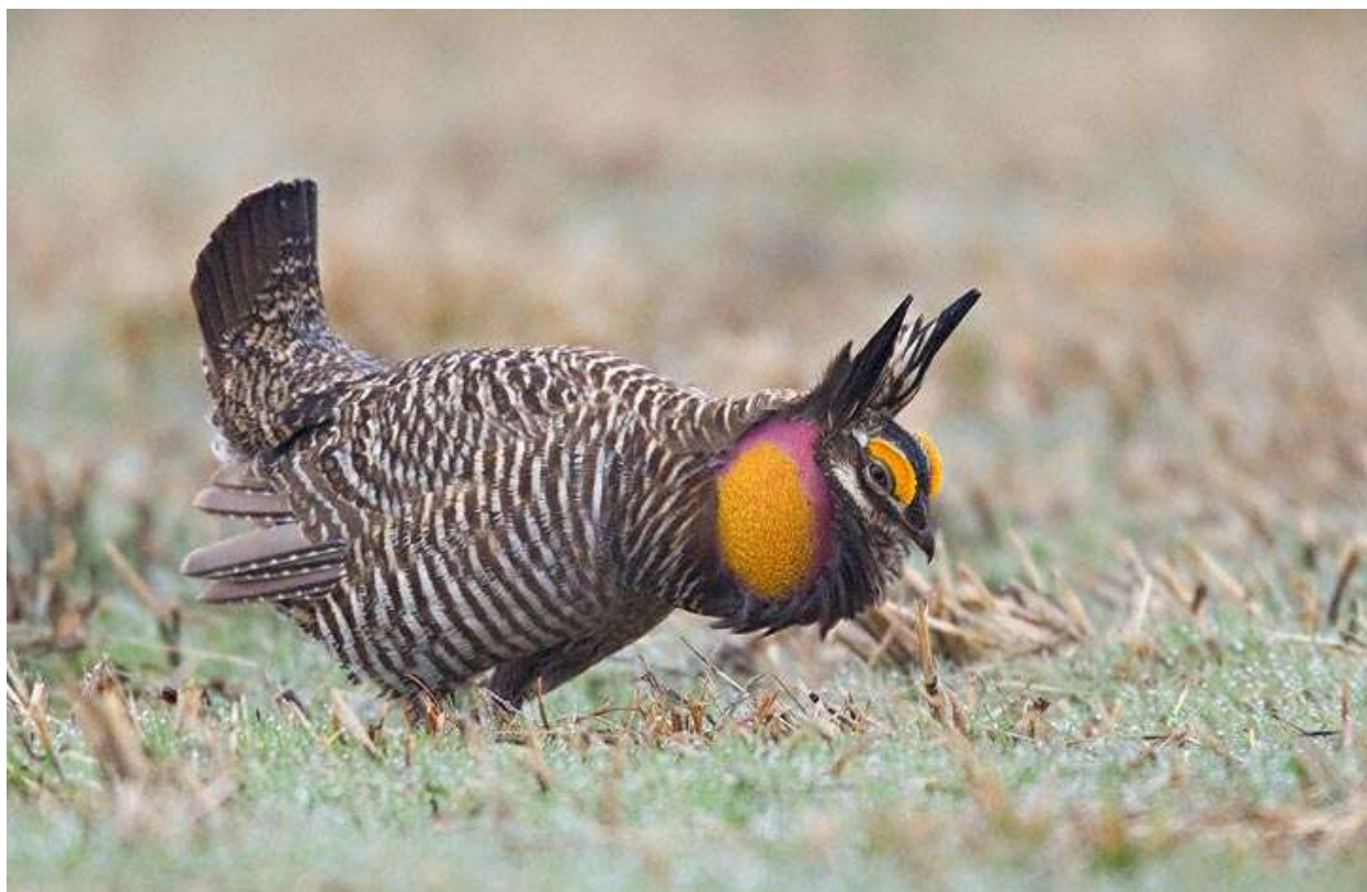
Greater Prairie-Chicken

Embark on an unforgettable spring adventure across Colorado's breathtaking landscapes, in pursuit of the state's five iconic grouse species—Greater Sage-Grouse, Gunnison Sage-Grouse, Dusky Grouse, Sharp-tailed Grouse, and the elusive White-tailed Ptarmigan. Timed to coincide with peak lekking season, this expertly guided tour offers intimate views of spectacular courtship displays in remote sagebrush basins and alpine tundra. From the windswept grasslands of Pawnee to the snow-capped passes of the Rockies, you'll explore diverse habitats and encounter a dazzling array of mountain specialties, including Rosy Finches, American Three-toed Woodpecker, Mountain Plover, Pinyon Jay, and many more.