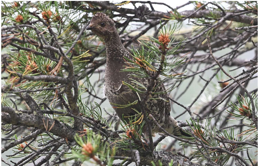
Dusky Grouse

Montrose offers exceptional birding, with access to riparian corridors, wetlands, and canyon habitats. It is a strategic base for continuing to explore the Gunnison Basin and Black Canyon. Today we visit Black Canyon of the Gunnison National Park where Dusky Grouse is possible. Black Canyon's steep cliffs, pinyon-juniper woodlands, Gambel