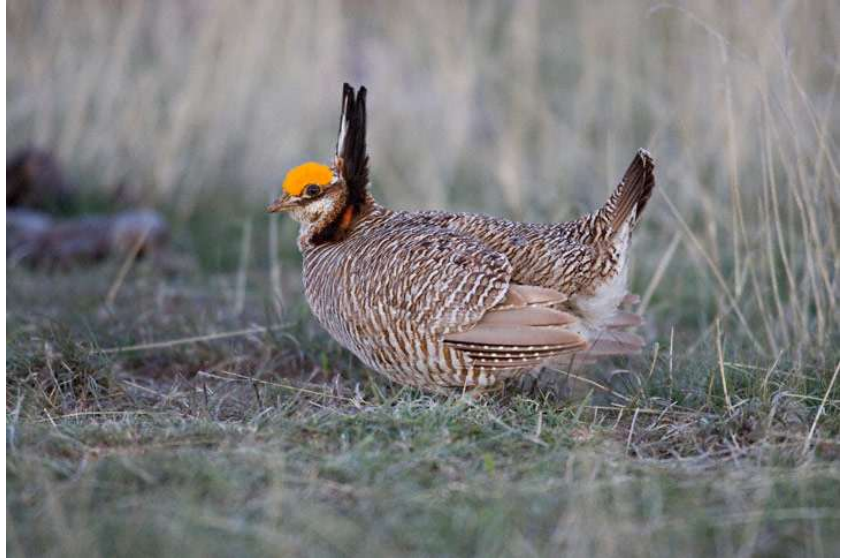
Lesser Prairie-Chicken

Early morning will find us on a Lesser Prairie-Chicken lek. Located in western Kansas, Scott City sits at the intersection of shortgrass prairie, playa lakes, and canyon country, making it a diverse and rewarding birding location. April is peak season for Lesser Prairie-Chicken lekking, and nearby reservoirs and state parks host a mix of migrants and breeding residents. In the afternoon,