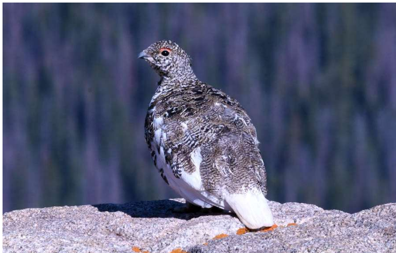
White-tailed Ptarmigan

We depart Denver and drive toward Gunnison, making several stops along the way. Loveland Pass, about one hour west of Denver, is primarily known for its sweeping views of the Continental Divide and mountain peaks - a popular destination for scenic drives. Loveland Pass offers rare access to alpine tundra habitat without a strenuous hike,