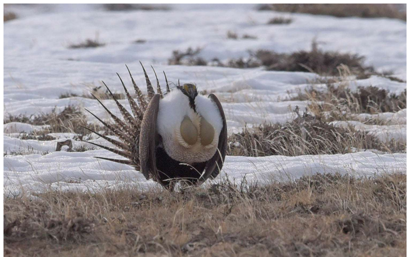
Greater Sage-Grouse

Day 7: Walden to Fort Collins. Located in North Park, a high-elevation basin surrounded by mountains, Walden sits at the heart of Colorado's sagebrush steppe and wetland ecosystems and one of the best places to find Greater Sage-Grouse in Colorado. We continue driving to Fort Collins after we have watched the Greater Sage-Grouse on their lek – exploring