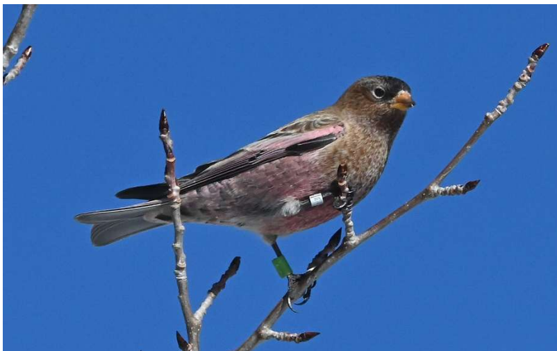
Brown-capped Rosy-Finch

oak uplands, and riparian zones along the Gunnison River create a mosaic of habitats that support a wide range of birds. In April, the park comes alive with breeding activity, early migrants, and resident species. Other notable species found here include White-throated Swift, American Dipper, Canyon Wren, Steller's Jay, Slate-colored Fox Sparrow, Woodhouse's Scrub Jay, Spotted Towhee, Clark's Nutcracker, Townsend's Solitaire, Violet-green Swallow, Peregrine Falcon, Hairy Woodpecker, Plumbeous Vireo, Western Tanager, and Northern Pygmy-Owl. Overnight: Holiday Inn Express, Grand Junction.