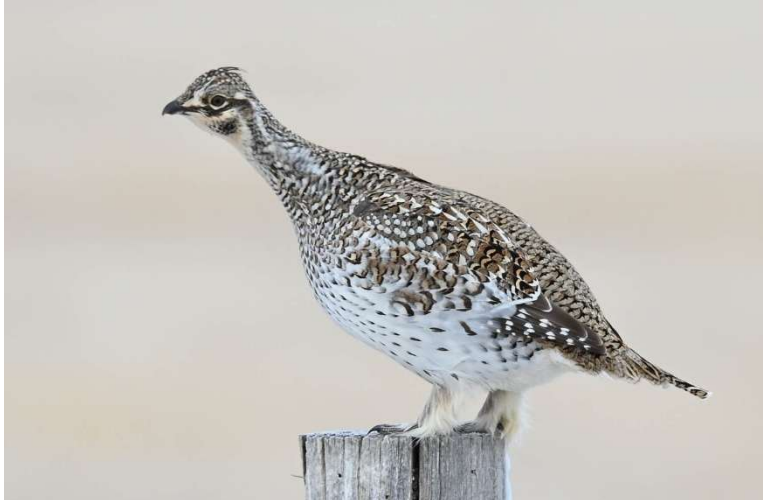
Sharp-tailed Grouse

morning, we will explore the canyonlands of Colorado National Monument searching for Pinyon Jays, Juniper Titmouse and Black-throated Sparrows. The predominant pinyon-juniper woodland throughout this region offers critical habitat for a diverse array of bird species. This region also encompasses the habitat where the Chukar, an introduced species from Eurasia, can be found. Other notable species found in this area include Western Bluebird, Bushtit, Black-headed Grosbeak, Lesser Goldfinch, Red-tailed Hawk, Gambel's Quail, Mountain Bluebird, Say's Phoebe, Canyon, Rock and Bewick's Wrens, Black-throated Gray Warbler, and Woodhouse's Scrub-Jay among many others. Overnight: Best Western Plus Deer Park Hotel & Suites, Craig.