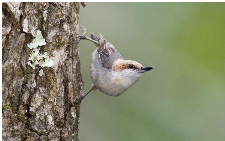
Brown-headed Nuthatch

and Bachman's Sparrow. We are also likely to see Red-headed Woodpecker, Brown-headed Nuthatch, Carolina Chickadee, Tufted Titmouse, Pine Warbler, and possibly Louisiana Waterthrush. Later, we'll visit Sandy Creek Park along the shores of Lake Steinhagen – a hidden gem for birding in the East Texas Pineywoods, offering a mix of lake, wetland, and forest habitats where birders can expect to see everything from waterfowl