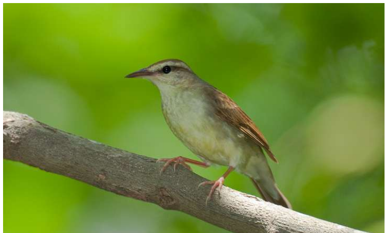
Swainson's Warbler

This morning we'll begin at Angelina National Forest, home to more than 150,000 acres of longleaf and loblolly pine stands, hardwood sloughs, riparian corridors, and reservoir edges along Lake Sam Rayburn. Our focus will be on searching for several pine forest specialties, particularly Red-cockaded Woodpecker (if not found at WG Jones State Forest)