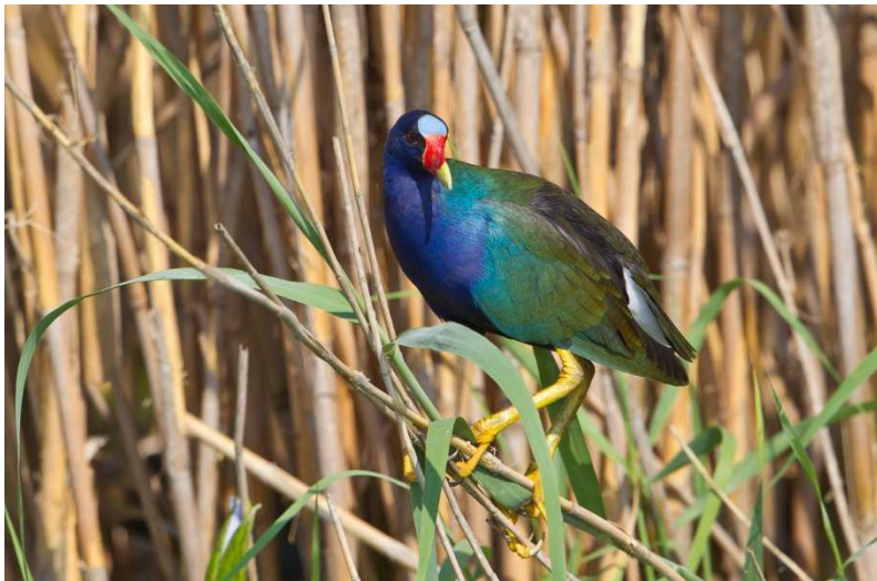
Purple Gallinule

and raptors to colorful warblers and orioles. Here we have a good chance of finding Yellow-billed Cuckoo, Acadian Flycatcher, Yellow-throated Vireo, Yellow-breasted Chat, Wood Thrush, and numerous warblers including Prothonotary, Swainson's, Kentucky, and Yellow-throated. Overnight: Holiday Inn Express & Suites, Jasper