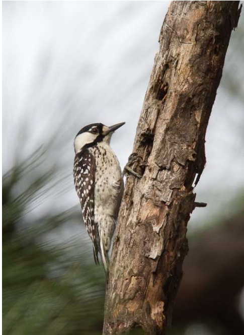
Red-cockaded Woodpecker

Participants will transfer to the hotel where a room will be reserved in their name. The hotel offers a complimentary shuttle service from the airport. We will meet in the hotel lobby at 5:00 p.m. for a brief orientation and welcome dinner. Overnight: SpringHill Suites Houston Intercontinental Airport, Houston.