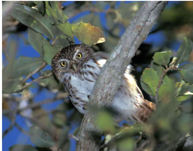
Ferruginous Pygmy-Owl

Day 4: King Ranch. We spend the day birding the Norias Division of the King Ranch. Norias is located on the southern end of the vast 825,000 acre ranch. The mesquite brushlands and oak mottes in this area are one of the few places in Texas where our target bird, the Ferruginous Pygmy-Owl, can be seen with some degree of regularity, although it is not guaranteed due to its secretive nature. Additional uncommon species of interest we