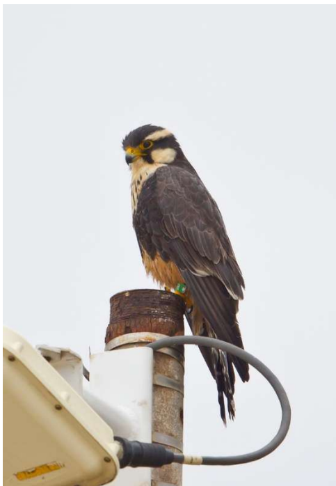
Aplomado Falcon

American White Pelicans, White Ibis, Tricolored Heron and a variety of wintering ducks. After the boat trip, we spend the remainder of the day birding in the Rockport area including Goose Island State Park, Rockport-Tule Creek Nature Preserve and several other nearby birding sites. These locations offer chances to observe various wintering passerines and waterfowl. Overnight: Hampton Inn and Suites, Rockport-Fulton.