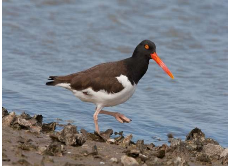
American Oystercatcher

This morning, we take a 3-hour boat trip to the Aransas National Wildlife Refuge to see the Whooping Cranes and a variety of other wading, shore, and water birds. The boat trip give us an opportunity to get close looks at family groups of Whooping Cranes as we cruise through the marshes brimming with bird activity. We are likely to see a large variety of waterfowl including Brown and