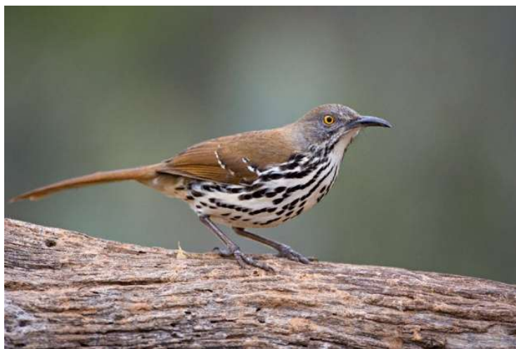
Long-billed Thrasher

may see include Tropical Parula, Audubon's Oriole, Northern Beardless-Tyrannulet, and Botteri's Sparrow. The various habitats in the ranch host many species predominantly found in south Texas, including Harris's Hawk, White-tailed Hawk, Buff-bellied Hummingbird, Hooded Oriole, Green Jay, Olive Sparrow and Long-billed Thrasher. The King Ranch is a haven for wildlife; we have a good chance of seeing White-tailed Deer, Wild Turkey, Javelina, and exotic Nilgai antelope. Overnight: Home2 Suites, Corpus Christi Southeast.