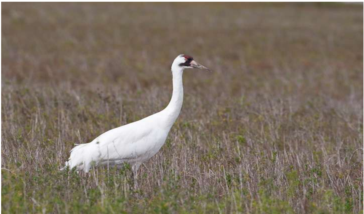
Whooping Crane

This tour includes two local tours: a boat trip to Aransas National Wildlife Refuge and a King Ranch tour. The focus is on seeing the Whooping Crane and Ferruginous Pygmy-Owl as well as visiting the various coastal preserves and inland birding sites to observe a mix of wintering waterfowl, shorebirds, waterbirds, and bird species typically found further south in the Rio Grande Valley. The Central Texas Coast includes the region extending from Kingsville and Corpus Christi to the coastal communities of Port Aransas, Rockport-Fulton, and Bay City. The Rockport-Fulton area of the Central Texas Coast is the winter home of the Whooping Crane. These birds migrate annually to the marshes of Aransas Bay from their breeding grounds in north-central Canada. In addition to the Whooping Crane, the Central Texas