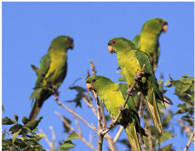
Green Parakeets

Located right on the Rio Grande River, Anzalduas County Park is a great location to look for mixed species flocks which often include Tropical Parula and Black-throated Gray Warbler. The fields near the entry of the park make this location an ideal spot to look for wintering raptors, sparrows, and Sprague's Pipit. We spend the afternoon visiting local sites including Frontera Audubon Nature Preserve in Weslaco and Quinta Mazatlán in McAllen. Although both