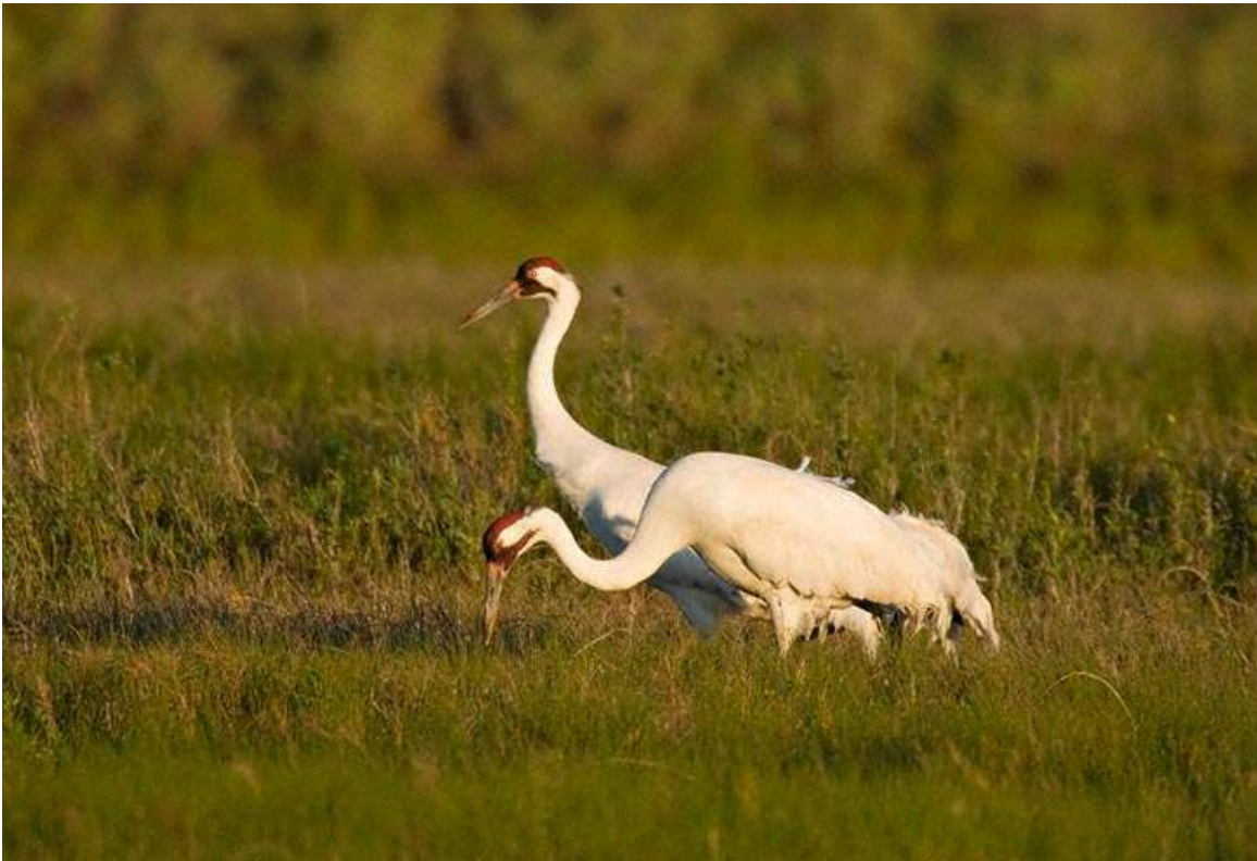
Whooping Cranes

The tour focuses on exploring the Rio Grande Valley, including its wintering birds, specialties and any rarities that may be found in the area. This tour also includes a three-hour boat trip to Aransas National Wildlife Refuge located on the Central Texas Coast to see Whooping Cranes and a King Ranch tour to see the Ferruginous Pygmy-Owl. Our itinerary will remain flexible to maximize our opportunities to see as many species as possible. Some of the locations we visit include Aransas National Wildlife Refuge and Leonabelle Turnbull Birding Center in the Central Texas Coast and Salineño Wildlife Preserve, Santa Margarita Ranch, Falcon State Park, and other iconic birding sites including Bentsen-Rio Grande Valley State Park, and Santa Ana National Wildlife Refuge in the Rio Grande Valley. Winter is an optimal season for observing vagrant bird species in the Rio Grande Valley. Examples of past rarities