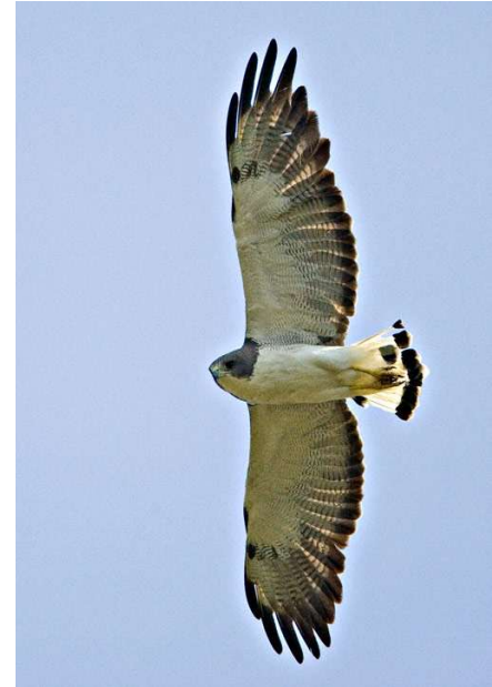
White-tailed Hawk

Northern Beardless-Tyrannulet, and Botteri's Sparrow. The various habitats in the ranch host many species predominantly found in south Texas, including Harris's Hawk, White-tailed Hawk, Buff-bellied Hummingbird, Hooded Oriole, Green Jay, Olive Sparrow and Long-billed Thrasher. The King Ranch is a haven for wildlife; we have a good chance of seeing White-tailed Deer, Wild Turkey, Javelina, and exotic Nilgai antelope. We then start our journey southward to the Rio Grande Valley which will be our base for the next six days of the tour. Overnight: Hampton Inn and Suites, Harlingen.