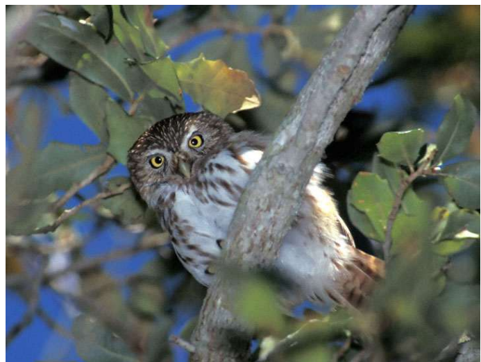
Ferruginous Pygmy-Owl

We spend the day birding the Norias Division of the King Ranch. Norias is located on the southern end of the vast 825,000 acre ranch. The mesquite brushlands and oak mottes in this area are one of the few places in Texas where our target bird, the Ferruginous Pygmy-Owl, can be seen with some degree of regularity, although it is not guaranteed due to its secretive nature. Additional uncommon species of interest we may see include Tropical Parula, Audubon's Oriole,