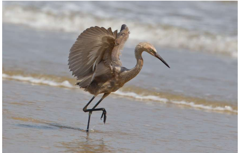
Reddish Egret

This morning, we take a boat trip to the Aransas National Wildlife Refuge to see the Whooping Cranes and a variety of other wading, shore, and water birds. We have the opportunity to get close looks at family groups of Whooping Cranes as we cruise through these marshes that are brimming with bird activity. We are likely to see a large variety of waterfowl