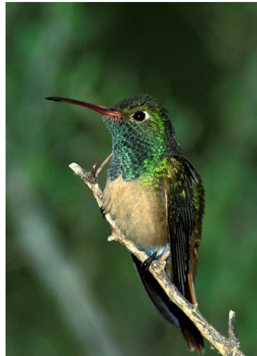
Buff-bellied Hummingbird

We focus our efforts on the mid-valley visiting Estero Llano Grande State Park, Santa Ana National Wildlife Refuge, and Bentsen-Rio Grande Valley State Park. Estero Llano Grande State Park is a small park offering a variety of habitats and with that a large array of bird species. We can find Common Pauraque and Plain Chachalaca in the wooded areas as well as White-tailed Kite, Least Grebe and Black-bellied Whistling-Duck in the open fields and wetlands. We continue west to the iconic Santa Ana National Wildlife Refuge. The refuge has a long history of being one of the top birding spots in the country and has hosted such rarities as Crane Hawk and Bat Falcon. We spend a few hours exploring the subtropical woodlands and ponds in the refuge where we may see Buff-bellied Hummingbird, Golden-fronted Woodpecker and Green Kingfisher. The refuge has a hawk watch tower which we visit to get a