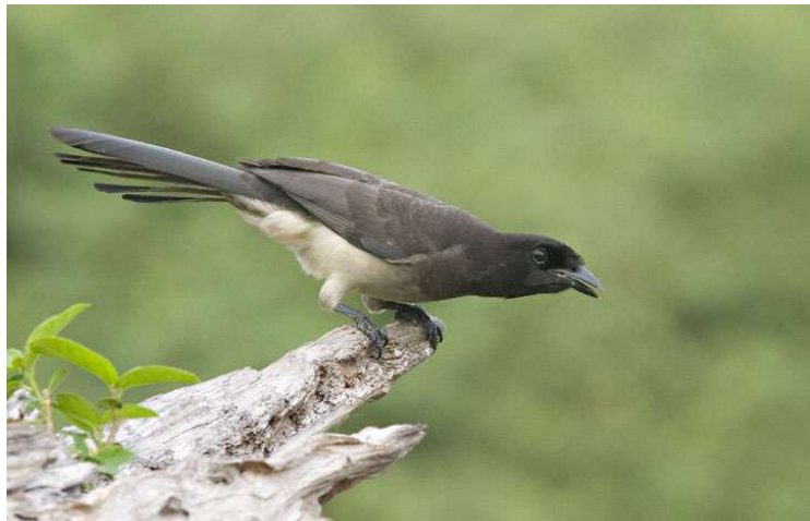
Brown Jay

Salineño. We return to the Upper Valley to pick up where we left off. Our first stop is Santa Margarita Ranch, which is a private ranch located downriver from Falcon Dam. This location offers a unique birding experience as you stand on high bluffs overlooking the Rio Grande River and the riparian woodlands of the property. Currently, the ranch is the only location in the United States where