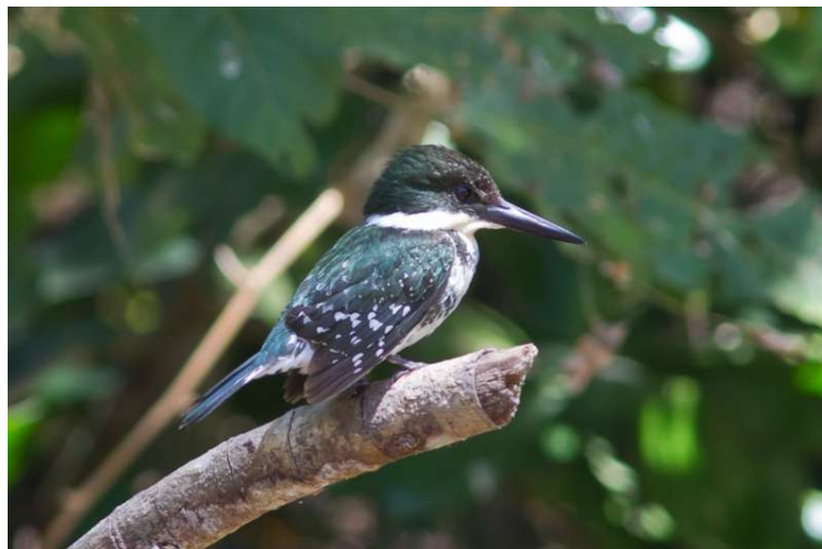
Green Kingfisher

sites are in residential areas, these locations offer a surprising variety of bird species with vagrants like Crimson-collared Grosbeak and Mexican Violetear reported in recent years. We end the day in McAllen visiting a local Green Parakeet roosting location. In addition to seeing a number of these tropical parakeets, we may also see a few Bronzed Cowbirds amongst the hundreds of Great-tailed Grackles. Overnight: Home2 Suites, McAllen.