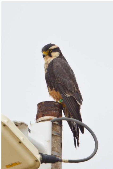
Aplomado Falcon

Today we depart for South Padre Island to visit the Convention Center Boardwalk as well as the Valley Land Fund Migratory Bird Sanctuary lots which provide habitat for neotropical migrants and overwintering species. The coastal marshes and mudflats are brimming with birds including Wilson's Plover, Snowy Plover, Reddish Egret, Brown Pelican among others. We also spend time along the Gulf beach looking for any ducks, shorebirds or pelagic species. The island can be full of avian surprises as there have been a number of rare visitors including Great Black-Hawk,