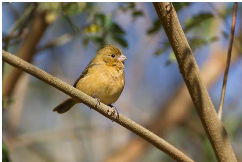
Morelet's Seedeater

of wintering ducks. The nearby Starr County Park offers many of the same bird species as Falcon State Park but provides us a second chance to pick up species we may have not seen at Falcon including Vermilion Flycatcher and Black-tailed Gnatcatcher. Later in the day we visit Fronzon, which is located along the Rio Grande River below Falcon Dam. The extensive river cane and brush in this location provide a great habitat for the highly localized Morelet's Seedeater. We drive some of the back roads in the area where we may add Scaled Quail, Rock Wren, and Lark Bunting. If time allows, we may spend some late afternoon time at Salineño to scan the Rio Grande River for Muscovy Duck, Mexican Duck and kingfishers. Overnight: Holiday Inn Express & Suites, Rio Grande City.