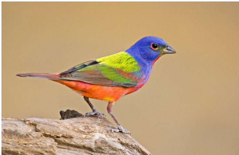
Painted Bunting

We drive to the eastern end of the Valley and bird the coastal areas including Laguna Vista Nature Trail, South Padre Island and other nearby areas. The walking trail and observation blinds of the Laguna Vista Nature Trail provide opportunities to see many species up close such as Green Jay, Olive Sparrow,