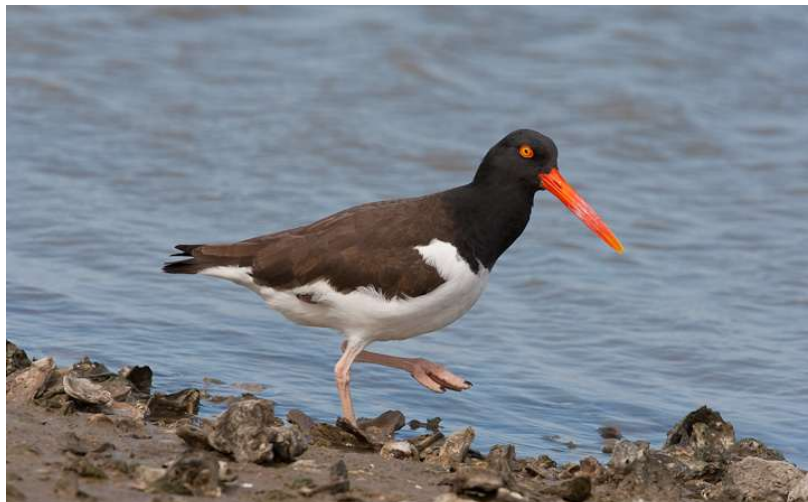
American Oystercatcher

Long-billed and Curve-billed Thrashers, as well as the possibility of migrants such as Painted Bunting. Next, we depart for South Padre Island to visit the South Padre Island Convention Center Boardwalk and the Valley Land Fund Migratory Bird Sanctuary lots which provide habitat for neotropical migrants and overwintering species. Depending on weather conditions, we may have the opportunity to witness a spring fallout with several species of