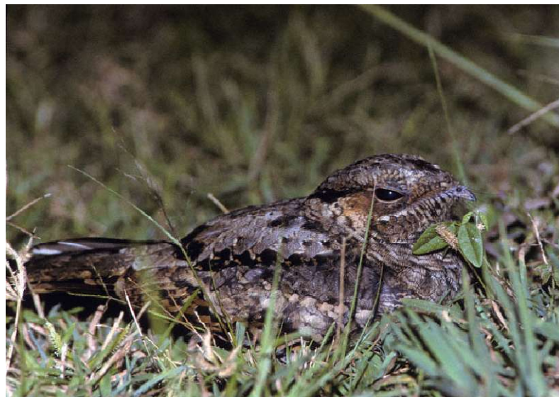
Common Pauraque

Saturday, April 25 – Day 4: Santa Ana National Wildlife Refuge and Estero Llano Grande State Park. Today we focus our efforts in the mid-Valley region visiting Santa Ana National Wildlife Refuge and Estero Llano Grande State Park. The iconic Santa Ana National Wildlife Refuge has a long history of being one of the top birding spots in the country. We spend a few hours exploring the subtropical woodlands and ponds in the refuge where we may see Buff-bellied Hummingbird, Golden-fronted Woodpecker, Couch's Kingbird, Great Kiskadee, Green Kingfisher, Groove-billed Ani, and Least Grebe. Like Bentsen State Park, Santa Ana also has a hawk watch tower which we visit to get a bird's eye view of the park's canopy and open skies, where we may see migrating raptors such as Mississippi Kite, Broad-winged and