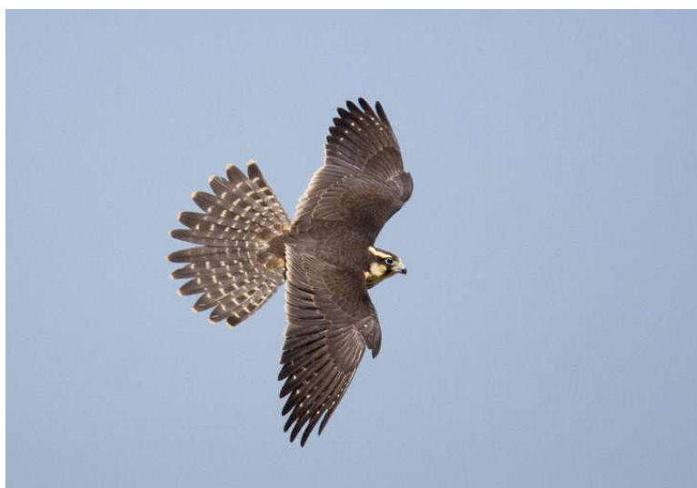
Aplomado Falcon

see various Rio Grande Valley specialty birds. We spend the morning exploring the park before departing for the coastal prairies located between Brownsville and Port Isabel. These coastal prairies are made up of various native grasses with mesquite, Spanish dagger, and prickly pear. There are also bodies of water in these prairies providing habitat for various waterbirds. Our main target will be the Aplomado Falcon which has re-established a small