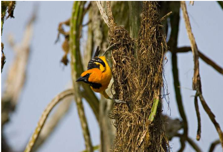
Altamira Oriole

day in McAllen to look for Green Parakeets returning to their roosting sites, we may also see Bronzed Cowbird among the hundreds of Great-tailed Grackles. Overnight: Home2 Suites, McAllen.