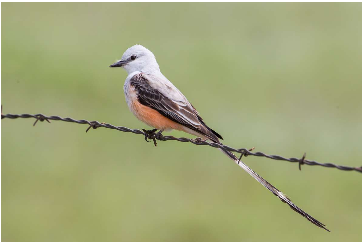
Scissor-tailed Flycatcher

The Rio Grande Valley is located in the southernmost tip of Texas where the Rio Grande River and Gulf coast meet and extends from South Padre Island west to Falcon Lake. Many tropical bird species reach their northernmost range in the Rio Grande Valley making it one of the top birding destinations in the country. The area features Gulf beaches, tidal flats, bays, coastal prairies in the eastern Valley, subtropical woodlands in the mid-Valley, and desert-like scrub in the western Valley. Its geographic location, varied habitats and potential to see many species of birds, including rarities, make it a prime destination for birders. Our schedule will be flexible to changing conditions, ensuring we optimize our opportunities to observe a